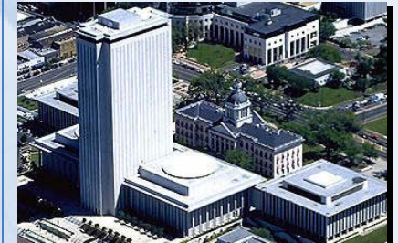
The Capitol Building - Tallahassee, Florida

Lake-Sumter Medical Society (LSMS) and the Florida Medical Association (FMA) are partners in serving member physicians. In addition to the benefits to LSMS members, the FMA offers consultation on a variety of legal issues, updates on medical economic topics, representation at the AMA level and vendor discounts. With the location of the FMA office in Tallahassee, a high level of interaction with legislators is maintained during the legislative session.